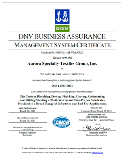
ISO 14001:2004 Certified