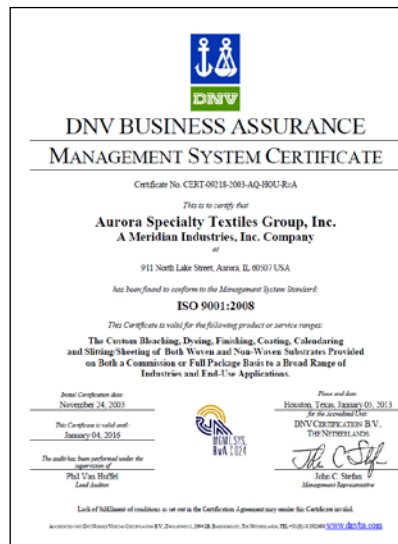
ISO 9001:2008 Certified