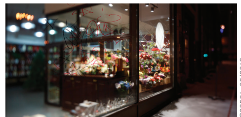
Clear Poly X